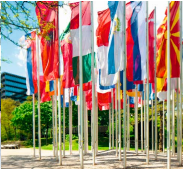
Principal Director Information Management