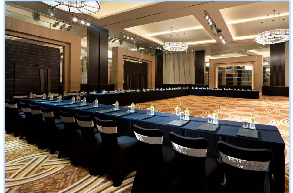
< Meeting room >