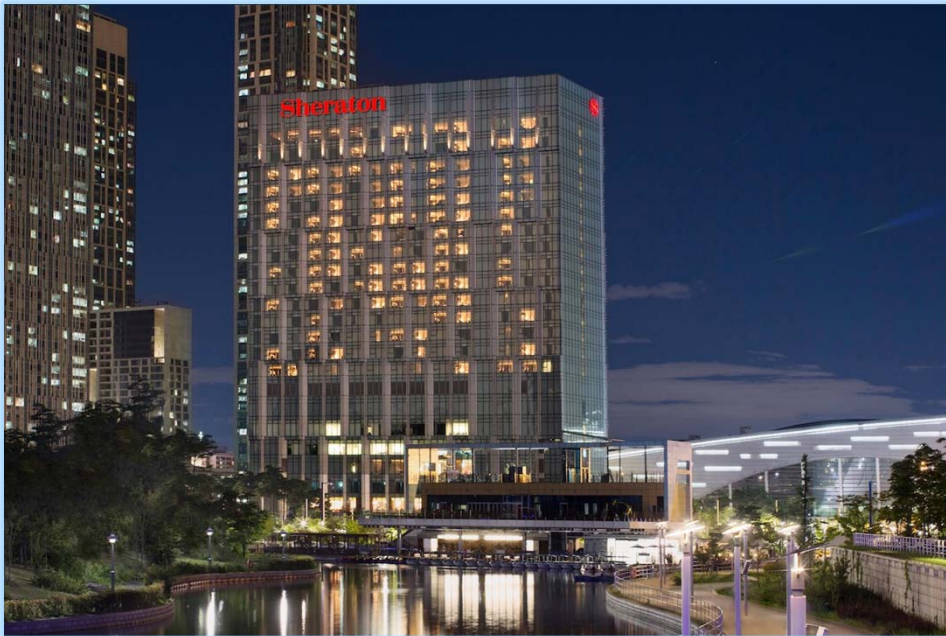
< Exterior >